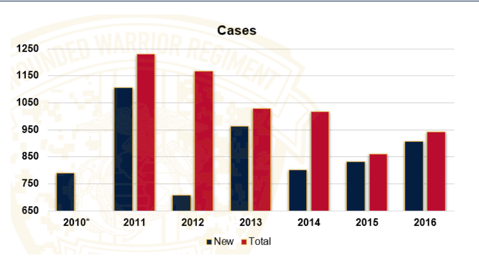
New and average total cases per month by year derived from DoD CMS (Department of Defense Case Management System). *DoD CMS launched in 2010 and became the WWR Recovery Care Programs' primary resource for documenting Comprehensive Recovery Plans (CRPs) for wounded, ill or injured Marines and Sailors.

Later in 2007, the Department of Defense and Department of Veterans Affairs stood up the congressionally-mandated Senior Oversight Committee (SOC). Having already done an internal assessment and institut-