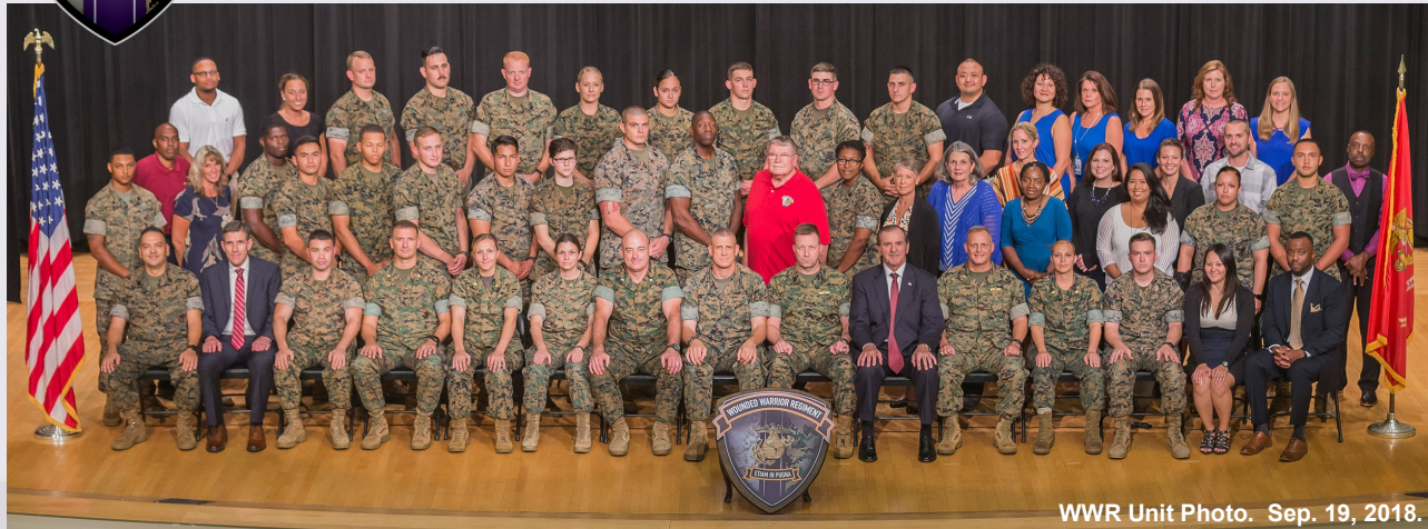
WWR Unit Photo. Sep. 19, 2018.