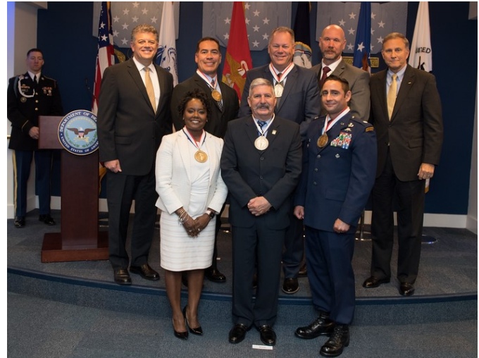
Awardees pose for photos during the Department of Defense Spirit of Hope Awards in the Pentagon's Hall of Heroes, Arlington, Va., Sept. 28, 2018

Able Forces, a non-profit organization whose mission is to provide employment and employment training to wounded, ill, and injured warriors and veterans and support their families in finding financial stability, works directly with military and veteran advocates, such as our transition team, to offer a link